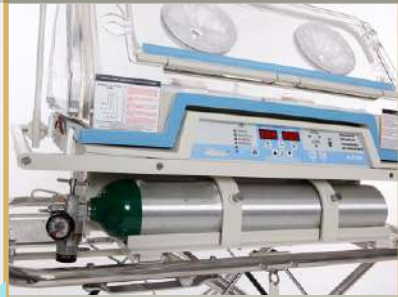
O2 CYLINDER FOR BABY INCUBATOR