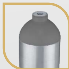
CARBON DIOXIDE (CO 2 )