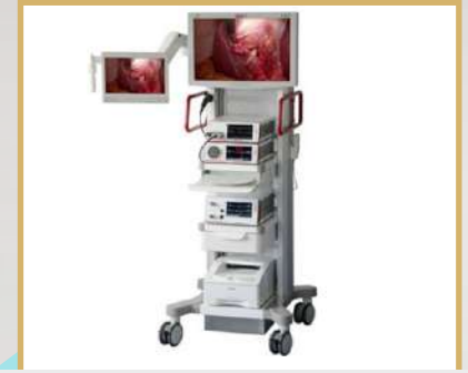
Co2 CYLINDER FOR LAPAROSCOPY MACHINE