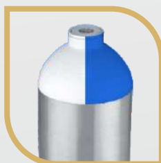
ENTONOX (O 2 + N 2 O)