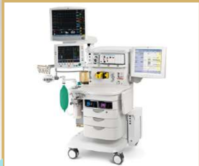
N2O & Co2 CYLINDER FOR ANESTHESIA MACHINE