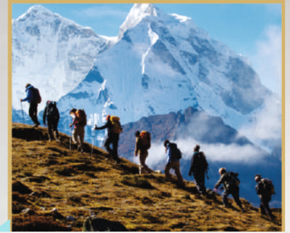
HIGH ALTITUDE & TREKKING