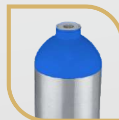
NITROUS OXIDE (N 2 O)