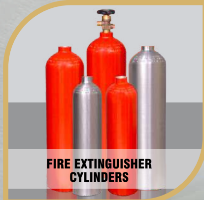
FIRE EXTINGUISHER CYLINDERS