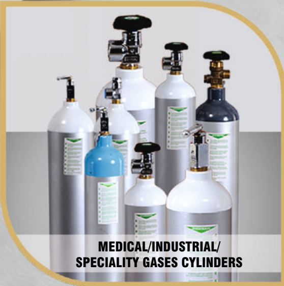
MEDICAL/INDUSTRIAL/ SPECIALITY GASES CYLINDERS