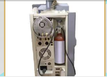
HELIUM CYLINDER FOR IABP MACHINE

Oxykit's Lightweight, Portable & Non Magnetic Aluminium Cylinders are widely used for Medical Gases in ICU, NICU, Operation Theatre, Emergency Ward, Incubator, Anesthesia Machine, Stretcher and Ambulances