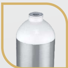
Oxygen (O 2 )

Mixture of Nitrous Oxide & Oxygen Gas Kit is also known as Pain Relief Gas has been used in Pain Relief, Sedation and Anesthesia, Since many years.